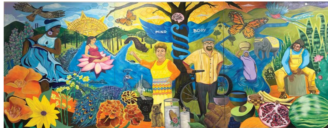
LA CONCORDIA WELLNESS CENTER MURAL