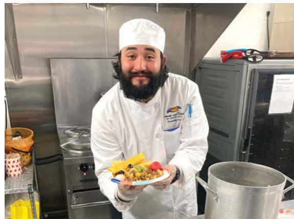
LOAVES & FISHES OF CONTRA COSTA COUNTY