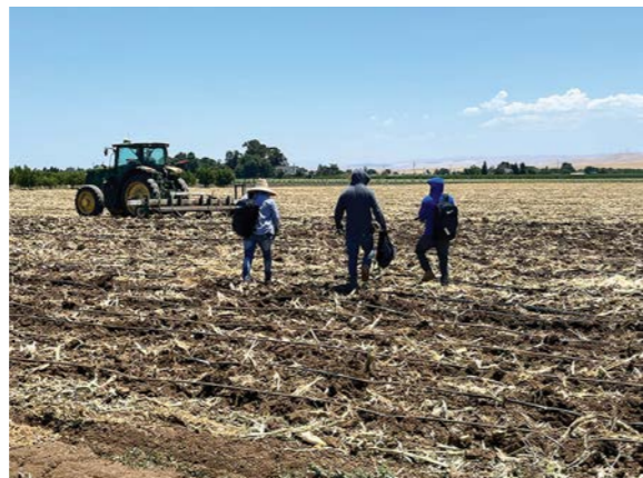
HIJAS DEL CAMPO